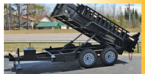
New 2015 Griffin Trailer 10 Dump Trailer. 7 foot x 10 foot. Dual axle, Cargo weight 4,996. stock 318157. MSRP $5,295.