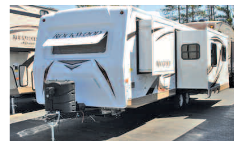
2016 Rockwood 2604 WS

SALE PRICE $12,995 AS LOW AS $109 A MONTH