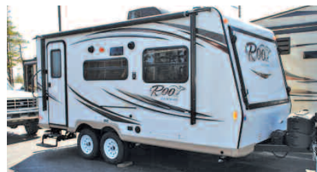
2016 Rockwood 19 Roo

SALE PRICE $37,995 AS LOW AS $295 A MONTH