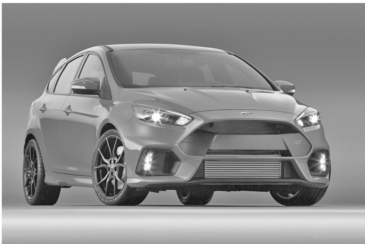
The all-new Ford Focus RS is a high-performance road car that pioneers the innovative Ford Performance All-Wheel Drive, delivering blistering cornering speed for thrilling performance and unbridled driving enjoyment.