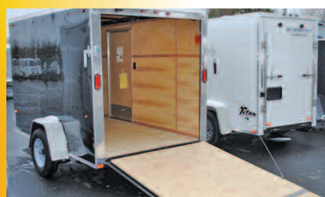
New 2015 Interstate 16x12 Wedge Nose Cargo Trailer

Sale Price $32,900 PAYMENTS AS LOW AS $275 A MONTH