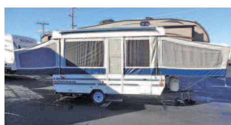
Used 1995 Dutchmen RV Pop Up Camper 1203S. Regular $3,895

SALE PRICE $16,995 AS LOW AS $155 A MONTH