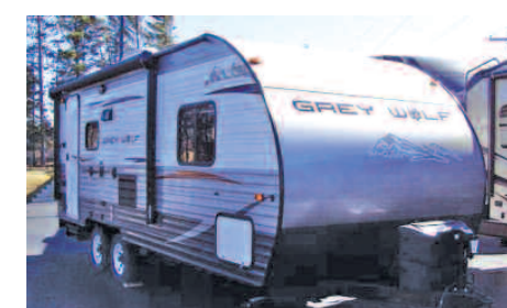
Used 2014 Cherokee Grey Wolf Travel Trailer

Toyhauler. Model 19RR. The Cherokee Grey Wolf 19RR toy hauler travel trailer by Forest River offers a large cargo area to store your off road toys while traveling. In the rear, there is a 69" x 74" ramp door. Regular $14,995.