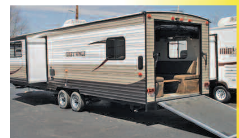
2016 Cherokee Grey Wolf 27RS Toyhauler

SALE PRICE $25,995 AS LOW AS $199 A MONTH