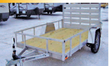
New 2016 Ramp Trailer