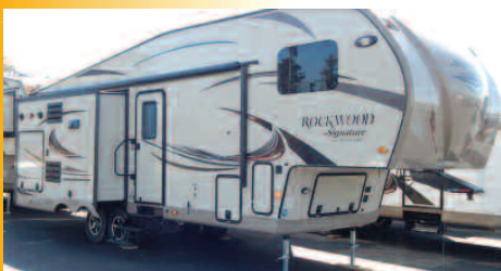
New 2016 Forest River RV Rockwood Signature Ultra Lite 8288WSA. Fifth Wheel. Hard to find 1/2 Ton Towable, 3 slideouts, fireplace. MSRP $46,887.

Our selection is growing each day as new 2015 and 2016 units are arriving. Stop by and see what's new for this year. Big discounts this week on new and used RV's and Trailers.